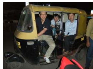
Business trip member