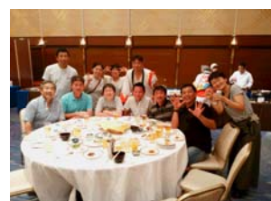
At dinner time