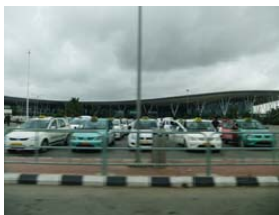
The Bengaluru International Airport