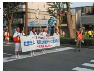
Beginning of the event

Thank you for supporting us through this event.