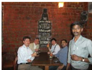
Enjoy drinking beer!