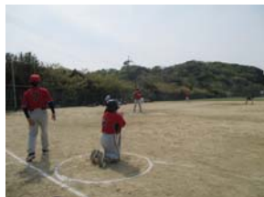
View of the game

Next game will be held in autumn. We will try to win next time!