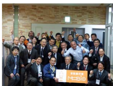
All members of "MOBIO-Café Meeting"

It was a really great time to meet with various industry people and exchange technical ideas and suggestions.