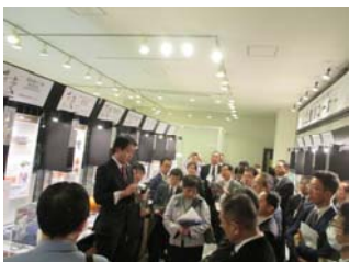
View of the presentation